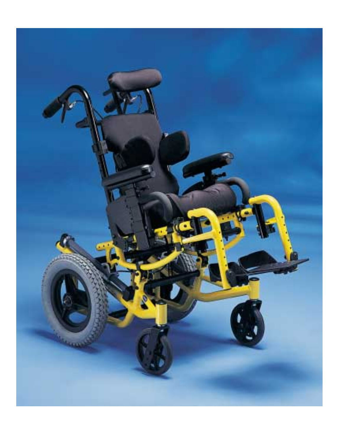
Shown on cover: The Solara™ jr. is shown with T-arms, 12" rear wheels, 6" composite urethane 6-spoke casters, adjustable-angle stroller handles and Electric Purple frame.

nvacare took the best the Solara<sup>™</sup> had to offer and built it into a size that's perfect for pediatric consumers. The Solara<sup>™</sup> jr. is special because it keeps the consumer's center of gravity almost perfectly stationary throughout the entire 50° tilt range. This gives the Solara jr. a compact wheelbase while maintaining excellent stability, providing comfort and security for the pediatric consumer. And it can help decrease startle reflex, since the consumer is tilted into the frame rather than around a fixed pivot point. Plus, the Solara jr. is lightweight and compact, so it's easy to transport. Better for clients. Better for caregivers. Simply a better pediatric tilt-in-space chair.